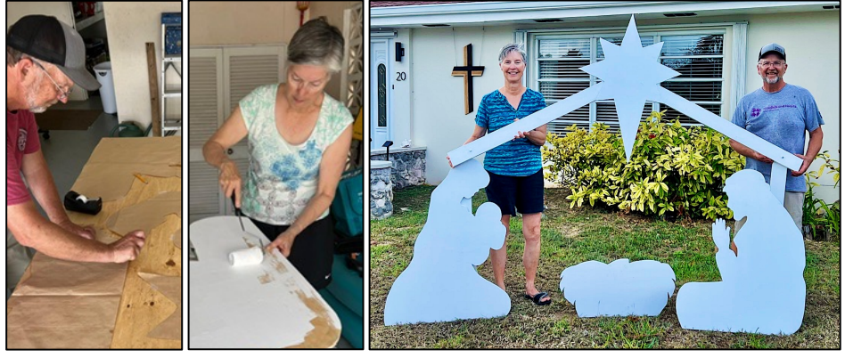
A paper pattern is designed and made for next banner. "Safe Harbour Rocks" – a new project where rocks / coral are painted and randomly placed around the neighborhoods.