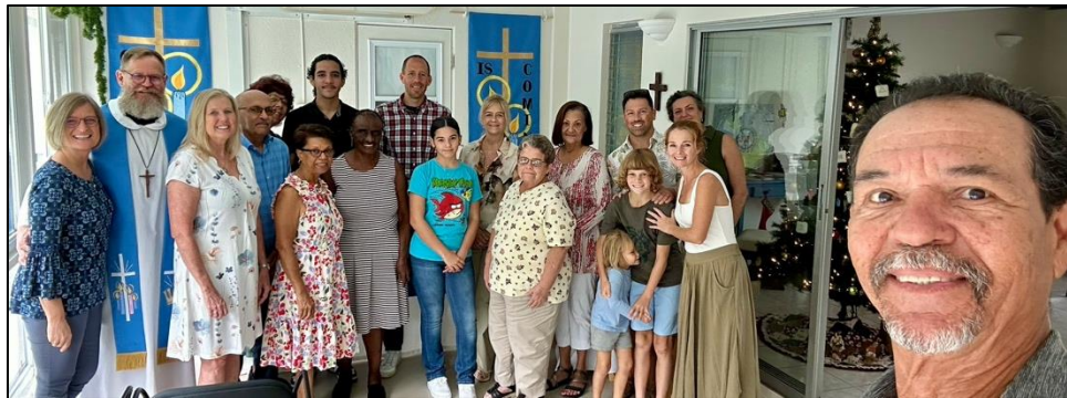
The Safe Harbour group after the Advent service and at the Cayman Thanksgiving potluck meal.