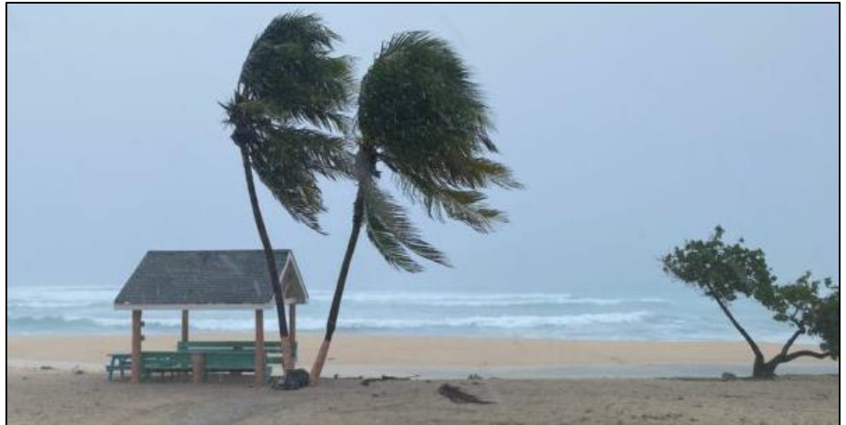
Wind-tossed trees at West Bay Beach. Cots set up ahead of Beryl at the emergency shelter at a local high school. A low-lying house at South Sound got flooded and damaged. Water was turned back on, and power lines repaired.